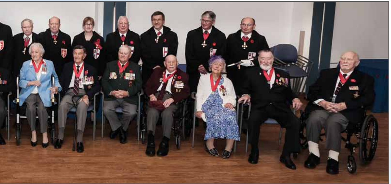
ms's way" in serving their country were honoured with being invested into the Order of St. George on November 3, 2014.