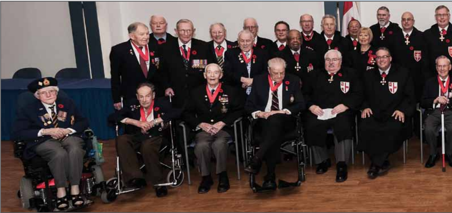
Order of St. George Investiture for 2014: Several Perley Rideau residents, tenants and volunteers who were placed in "honor"