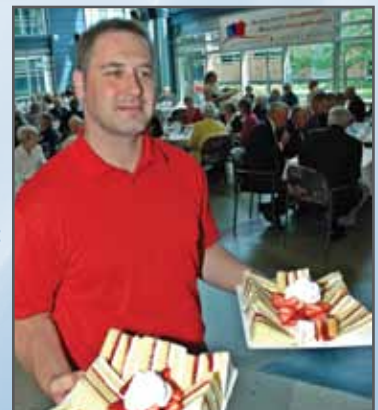
▶ LONG ON SHORTCAKE: Perley Rideau staff served platters of delicious strawberry shortcake to some 350 celebration guests on June 18.