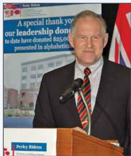
▲ CAMPAIGN SUPPORTER: Former Chief of Defence Staff General (Ret'd) Walter Natynczyk and president of the Canadian Space Agency lends his support.