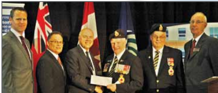
▲ LEGION DONATION: The Perley Rideau Foundation gratefully receives $3,000 from the Royal Canadian Legion Pointe-Gatineau Branch 058 and $3,000 from the Royal Canadian Quebec Provincial Command Service towards the Veterans Priority Needs List.