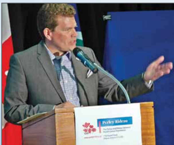
▲ GREETINGS FROM CITY HALL: City of Ottawa Deputy Mayor Steve Desroches assures the assembly that the Perley Rideau can expect an on-going relationship with the municipal government.