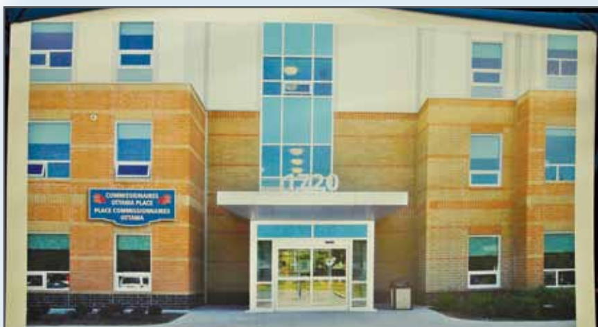
▲ NEW BUILDING NAMED: This rendering shows new signage when Building A is officially designated Commissionaires Ottawa Place / Place Commissionnaires Ottawa.