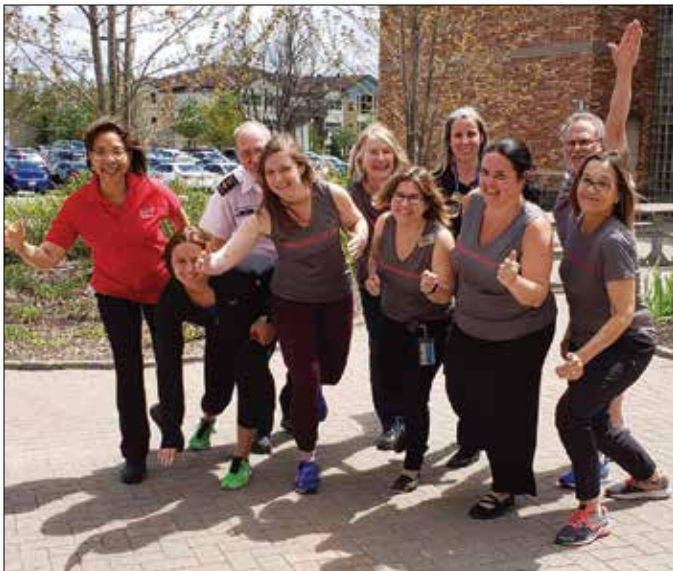
10 members of Team Perley Rideau pose for the camera.

A s the popularity of Tamarack Ottawa Race Weekend continues to