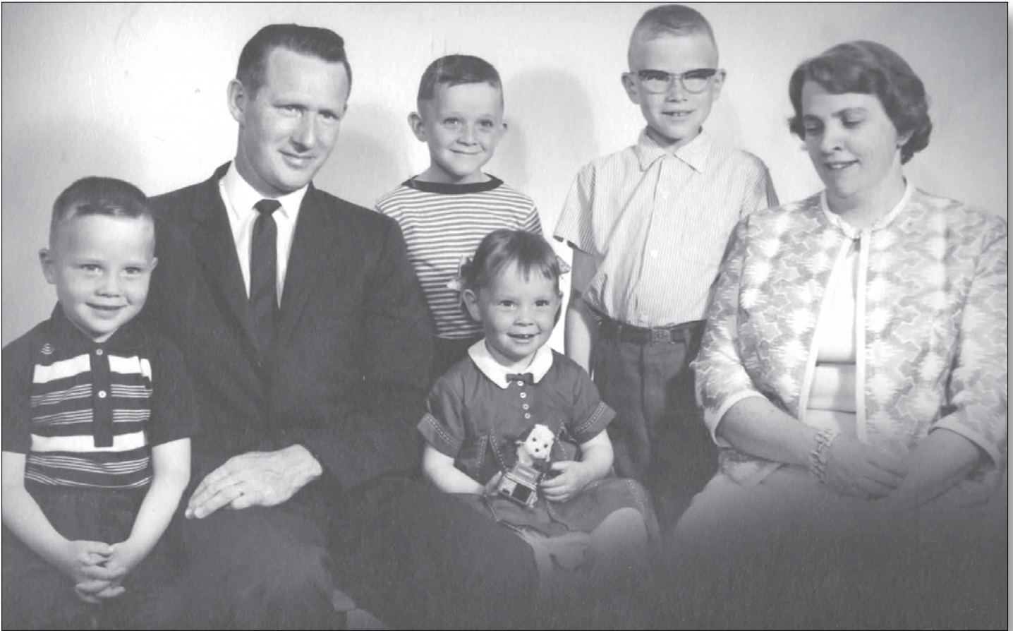
The MacDonald family in the mid-1960s.

bedroom-plus-den apartment in a new innovative housing project known as the Seniors Village. Built in 2013 with the support of donors and three levels of government, the Village features 139 seniors' apartments and ready access to a host of services, therapies and activities.